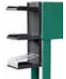
061240 Shelves for storing.