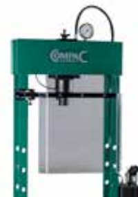
061242 Protection guard.