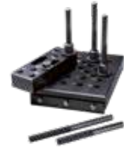
061248 Universal bearing removal support.