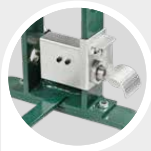
Foot operated air approach feature.