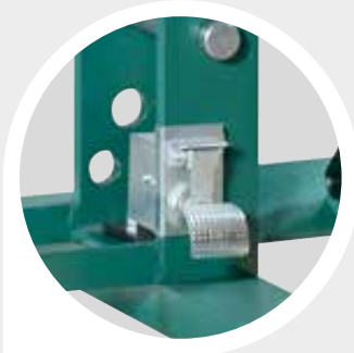
Foot operated air approach feature.