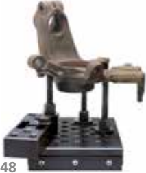
061248 Universal bearing removal support.