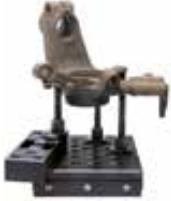
061248 Universal bearing removal support.