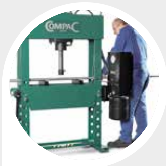
A 90° hinged pump unit enables easier insertion of longer work-pieces.