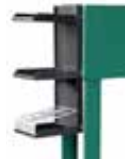
061240 Shelves for storing.